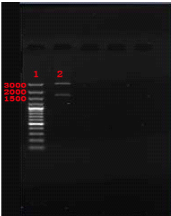
Figure 2. Agarose gel electrophoresis of construct (S1-pTZ57R) digested by EcoRI and NotI. Lane 1: Ladder (100 bp); lane 2: digested construct.