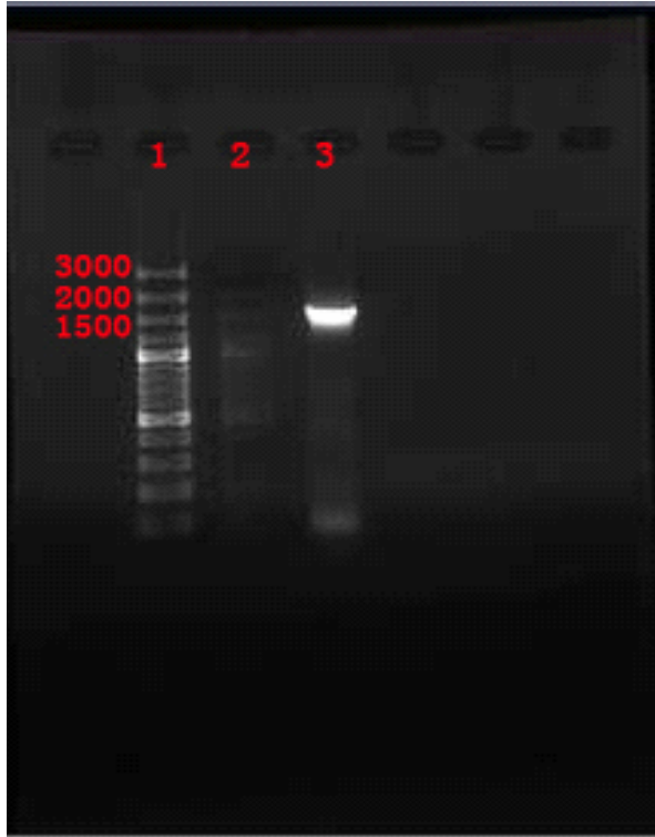
Figure 1. PCR product of amplified S1 gene. Lane 1: Ladder (100 bp); lane 2: negative control; lane 3: amplified S1 gene (about 1700 bp).